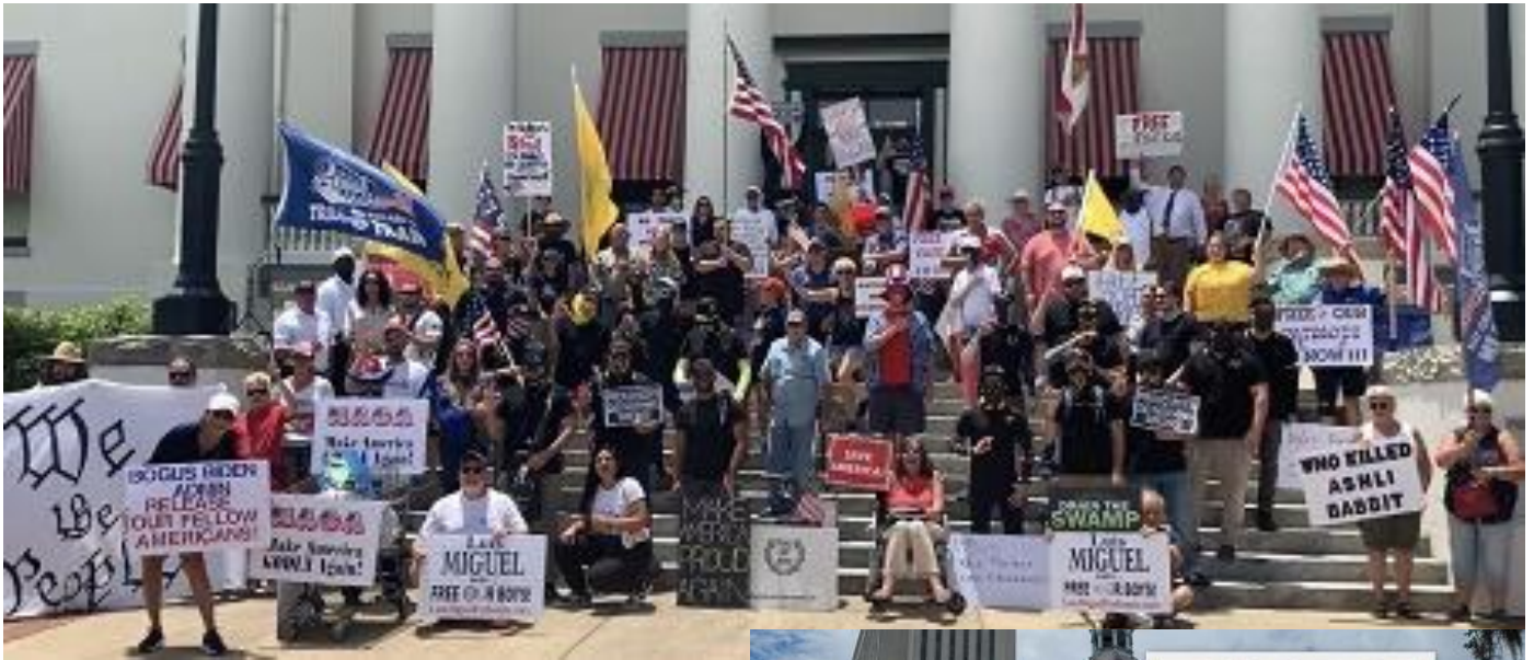
TCCR Staff Photos