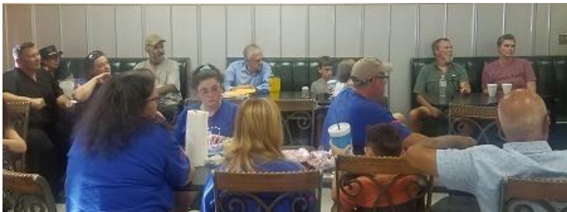
TCCR Staff Photo