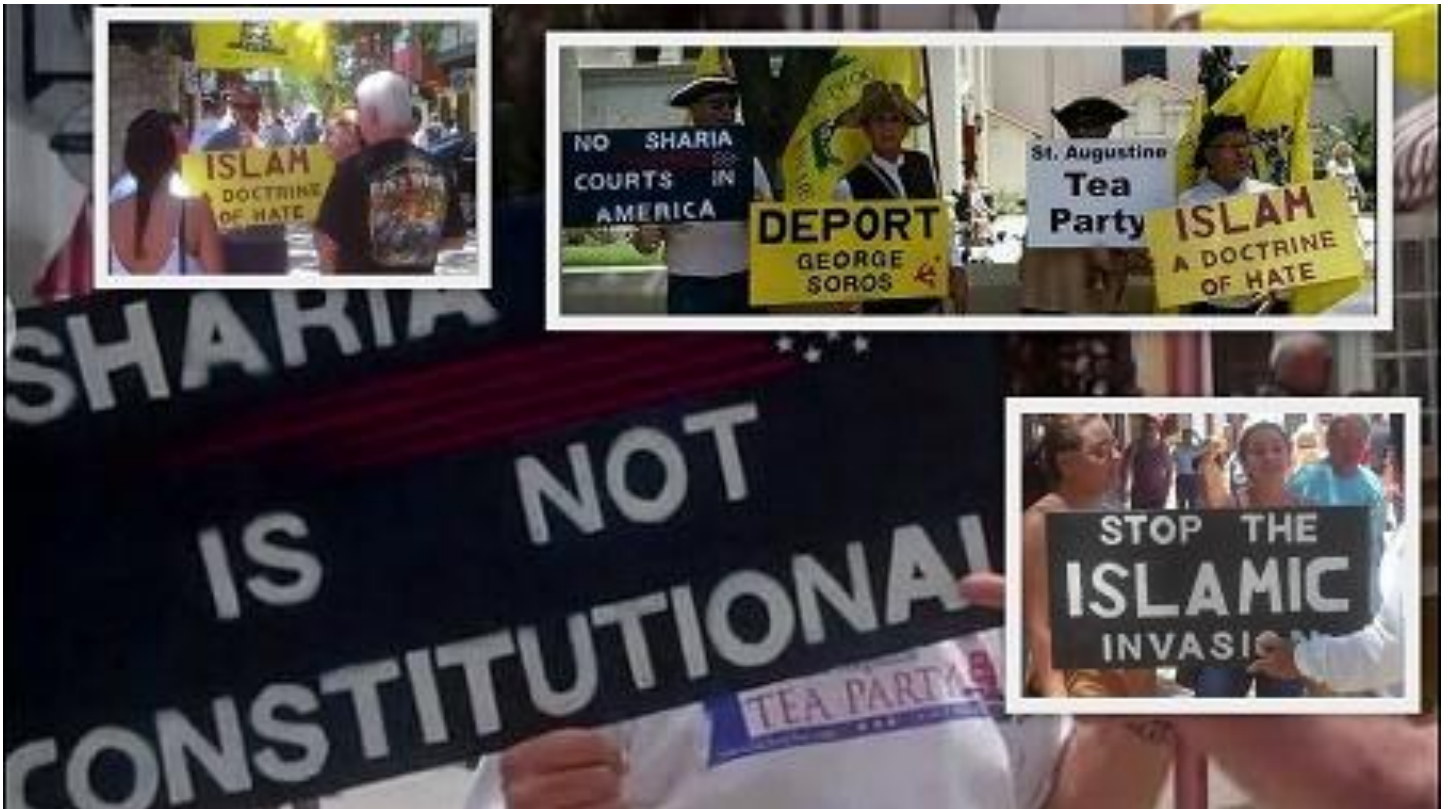
TCCR Staff Photos on St George Street St. Augustine June 10. 2017

Early on, The Town Criers were aware of the collaboration between the Islamists and the Communists. Their combined efforts are to undermine the United States and the Western world. Town Criers understood that Islam is not a religion, but civil jurisprudence for Muslims. Since Sharia and the Constitution both claim supremacy in law, they are not compatible. On June 10, 2017, the St. George Street middle-class focus group's concurred when exposed to the signs pictured above. Editor