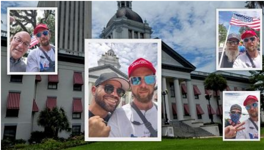
TCCR Staff Photos

number of people incarcerated, as compared to other States, with 53. Texas follows with 45, with total arrests being well over 500. The name of the government's game is 'intimidation'. Florida is probably one of the freest States in the Union. Florida's refusal to follow directives from Washington, regarding the fake pandemic, has prompted what appears to be retaliation against her citizens. Texas, also a prosperous state because it refuses to be shut down, is experiencing a similar attack. Disparity of Floridian arrests prompted Tallahassee, the State's Capital, to be selected as a fitting place to express dissatisfaction with the criminal element that occupies Washington and the demands for the immediate release of the January 6 th Political Prisoners held in the DC Jail.