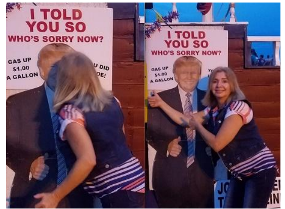
TCCR Staff Photos