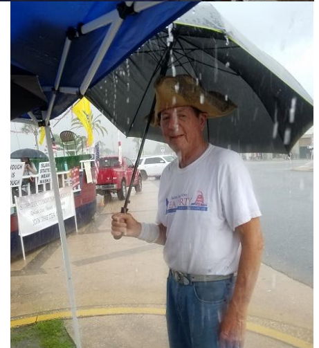
TCCR Staff Photos